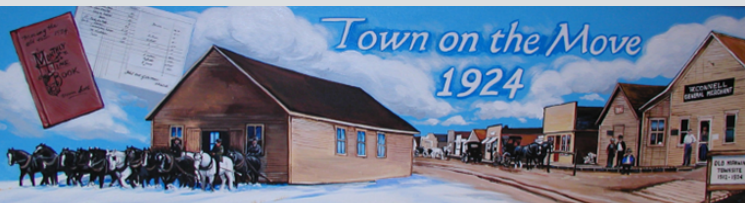
Members of the Nipawin Art Club | 12' x 64' Acrylic on Crezone | 215 1st Ave. W