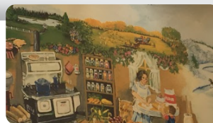
Lorraine D. Bergen (2004)

The mural illustrates the early settlers to this area and their means of procuring and preserving food. A miniature was painted and sent to Transcontinental Spot Graphics, Winnipeg, and Manitoba for digital reproduction and enlargement on vinyl.