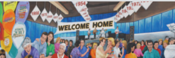
Members of the Nipawin Art Club | 4'x8' Acrylic on Crezone | 224 Centre St

Homecomings bring many things, including joy, dancing, music, and visiting. Commissioned by the Homecoming 2010 committee, this mural depicts the typical "homecoming". Included in the mural are 10+ hearts at various locations. The artist included these as a reminder that "all hearts come from homecoming". In addition to the Homecoming scene, the top right shows the four Hudson cars won at Nipawin's first car bonspiel in 1947; a curler in the traditional curling pose of the day and a golfer reminding us of Nipawin's beautiful golf course, the Evergreen. Evergreen Centre was chosen as the location for the mural, for all but one of the six homecomings were hosted here.