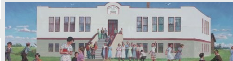
Zhong Ruh-Hang (2002) | 8' x 32" - Latex on Crezone | 206 2nd Ave E

Nipawin Public School, later known as Central School, housed all the students of the area from grades 1-12. "Nipawin Public School" is now located on 206 2nd Ave East and was realized through contributions from the Nipawin Heritage Society, the community, and Murals of Nipawin Inc.