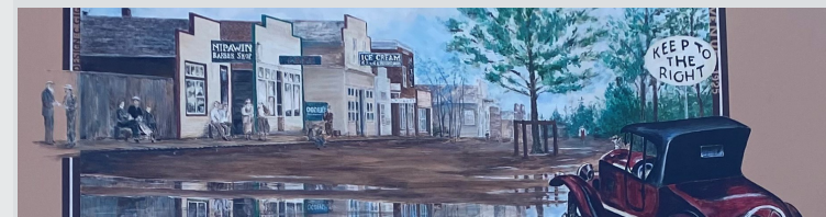
Members of the Nipawin Art Club | 4'x8' Acrylic on Crezone | 224 Centre St

Vibrant colours were utilized in the vintage Nipawin street scene to bring out the freshness of the new day following a rain. This mural was realized through contributions from the community and Murals of Nipawin Inc.